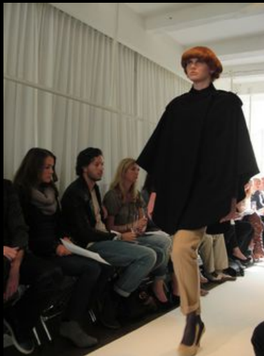
Winter must-have: the cape. SOBER sells them in camel or black at Kabinet, Herenstraat 13 Amsterdam.